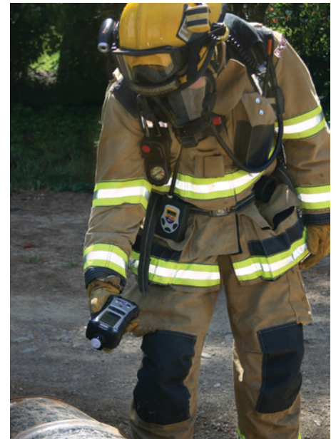
MultiRAE Pro with RAELink3 Mesh used for screening potentially hazardous drums